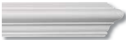
Plantation Grove Chair Rail - #16580