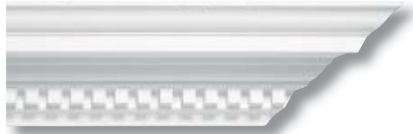
Raleigh Tavern Crown - #16330 & 16380