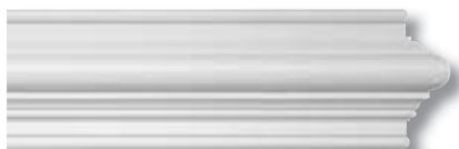
Robert Carter House Chair Rail - #16590