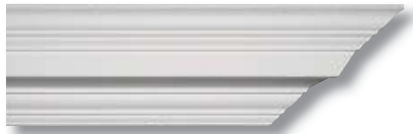
Peyton Randolph Crown - #16300 & 16350