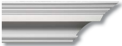
Governor's Palace Cove - #16310 & 16360