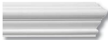
Peyton Randolph Chair Rail - #16560