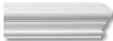
Wythe House Chair Rail - #16570