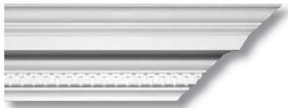
Governor's Palace Fretwork Crown - #16320 & 16370