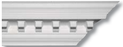
Nicolson House Crown - #16340 & 16390